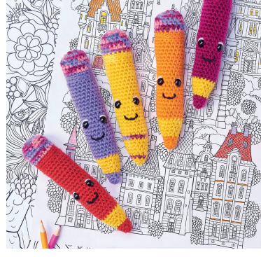
Young crafters will adore these cheeky crayons, what a fun addition to their pencil cases when they go back to school!

Finally yc days to yol out that eve yarn stash! Th patterns are the storage solutio yarn, notions, pl and hooks. 2000 Ree patterns are the ultimate