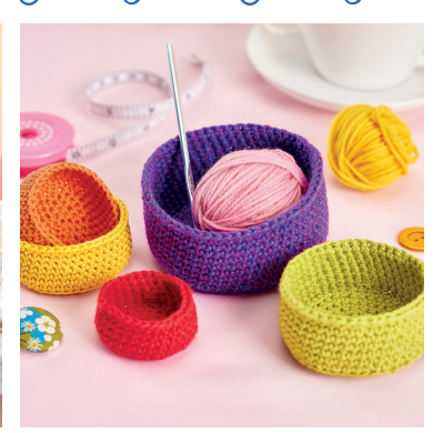
These stackable pots are neat to put away when you're not using them