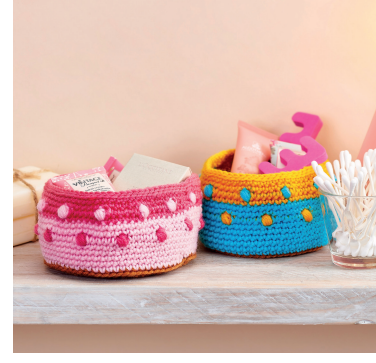
Use these cute containers to keep uour hooks, stitch markers and scissors in one neat place