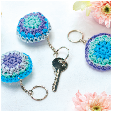
Never lose your keys again with our colourful keyrings; why not make them in different shades for all the familu?

Add something fruity to your outfits with this cute cherry brooch