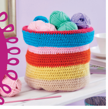
Create a colourful storage basket to squish all your yarn into

Finally yc days to yol out that eve yarn stash! Th patterns are the storage solutio yarn, notions, pl and hooks. 2000 Ree patterns are the ultimate